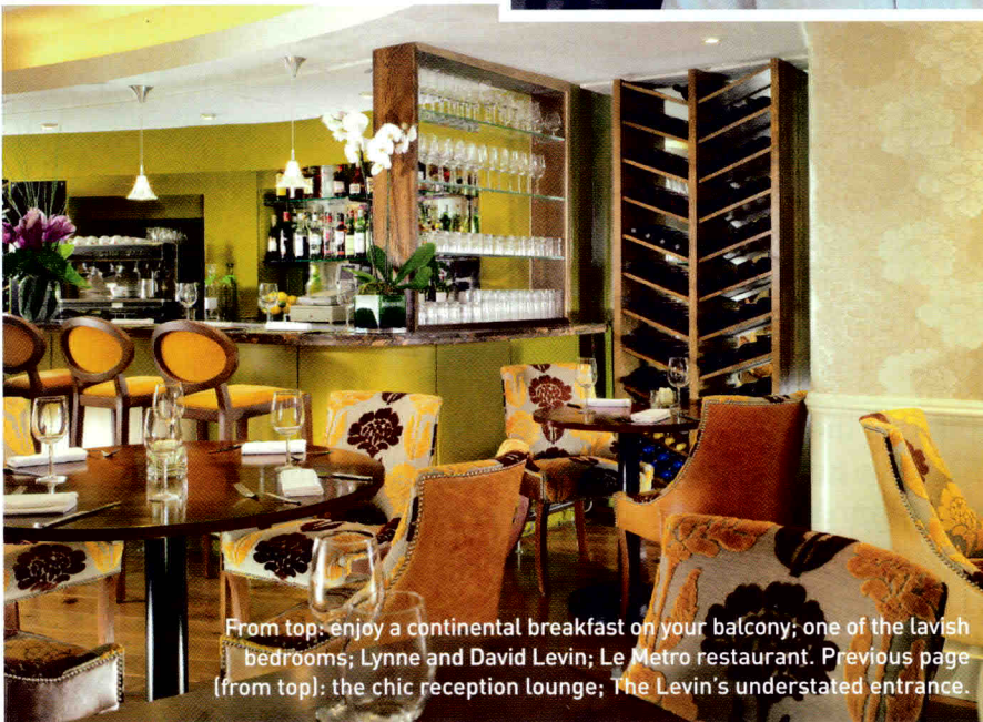
From top: enjoy a continental breakfast on your balcony; one of the lavish bedrooms; Lynne and David Levin; Le Metro restaurant. Previous page (from top): the chic reception lounge; The Levin's understated entrance.