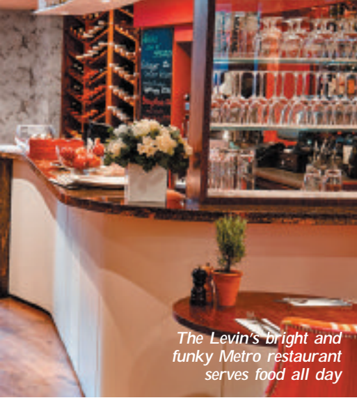
The Levin's bright and funky Metro restaurant serves food all day