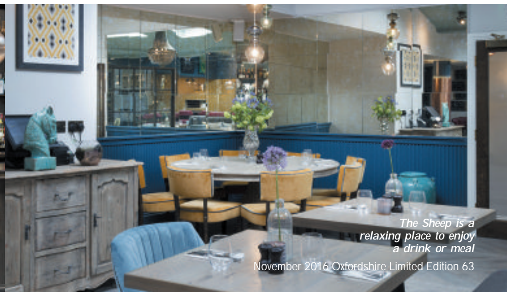
The Sheep is a relaxing place to enjoy a drink or meal