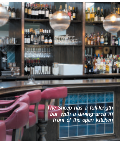
The Sheep has a full-length bar with a dining area in front of the open kitchen

The Sheep on Sheep Street, Stow-on-the-Wold, Gloucestershire GL54 1AG, call 01451 830344, thesheepstow.co.uk.