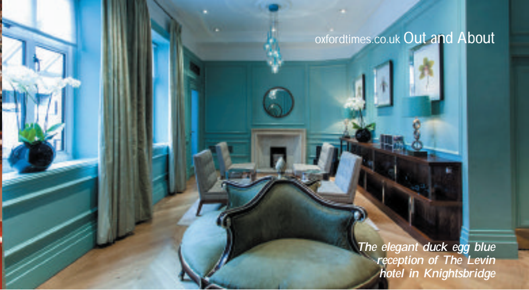
The elegant duck egg blue reception of The Levin hotel in Knightsbridge