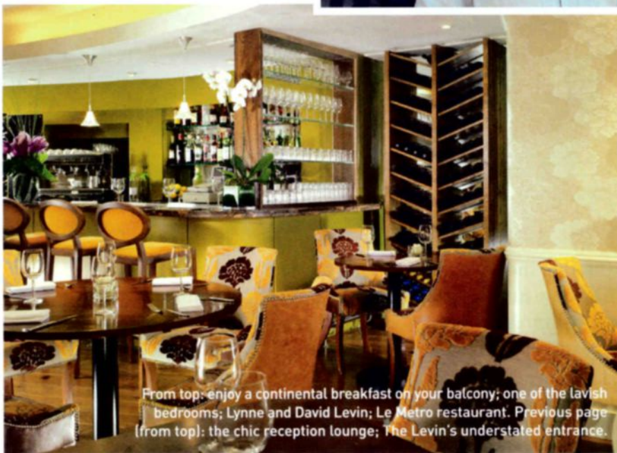
From top: enjoy a continental breakfast on your balcony; one of the lavish bedrooms; Lynne and David Levin; Le Metro restaurant. Previous page (from top): the chic reception lounge; The Levin's understated entrance.