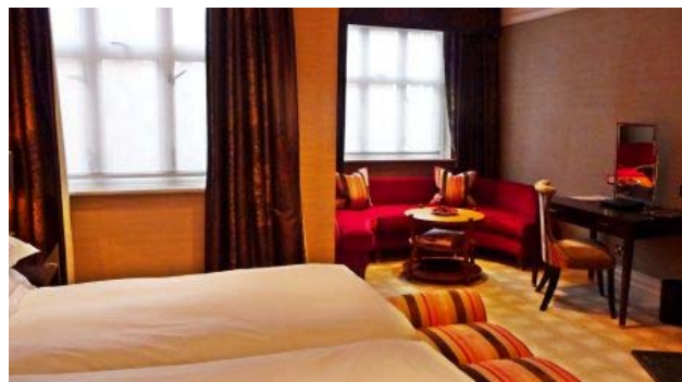
The Levin Deluxe Room